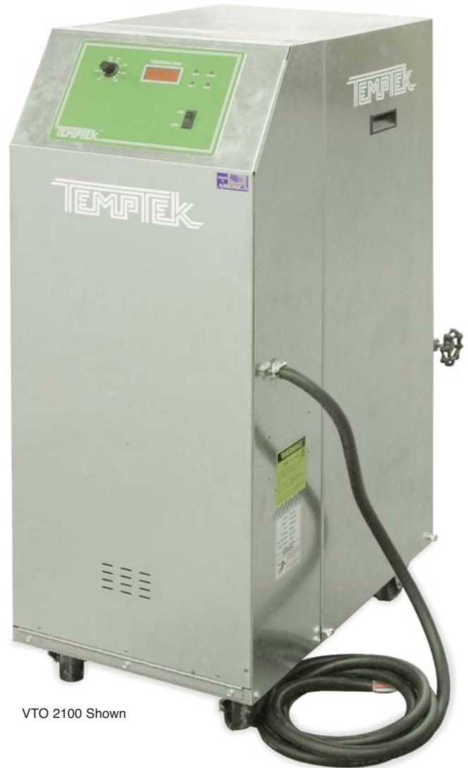
VTO 2100 Shown