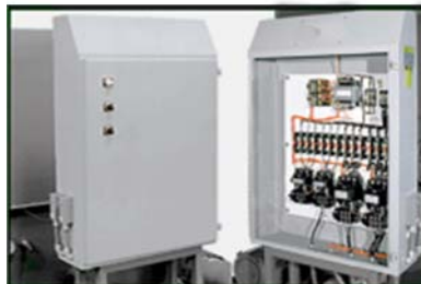
Optional system control console.