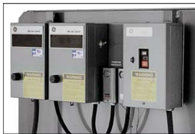
Starters shown mounted & wired.

Starters, valves, and thermostats are supplied as components and shipped loose for field installation with drawings supplied to ease installation. Items can be sold as components to allow customizing systems to customer requirements. Also this makes changes to existing systems a simple process.