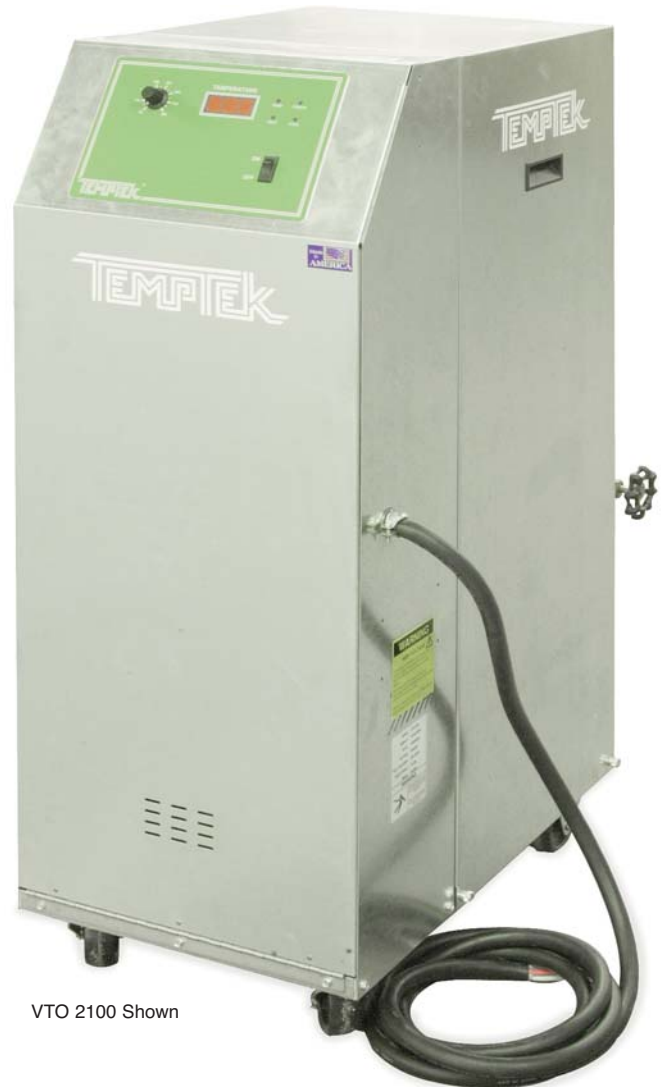
VTO 2100 Shown