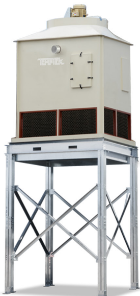
PT-135-G3 model shown on a galvanized stand.