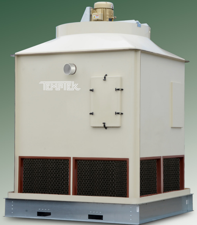
PT-135-G3 model shown.