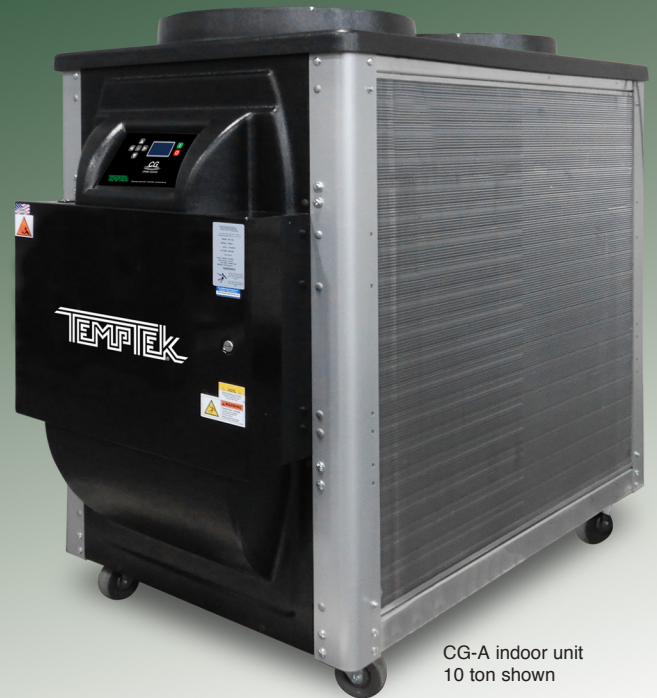
CG-A indoor unit 10 ton shown

The CG-A Series portable chiller provides precision temperature control from an economically affordable and reliable unit. Perfect for applications such as plastic injection molding, blow molding, extrusion and other industrial applications.