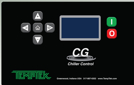
CG Control Instrument