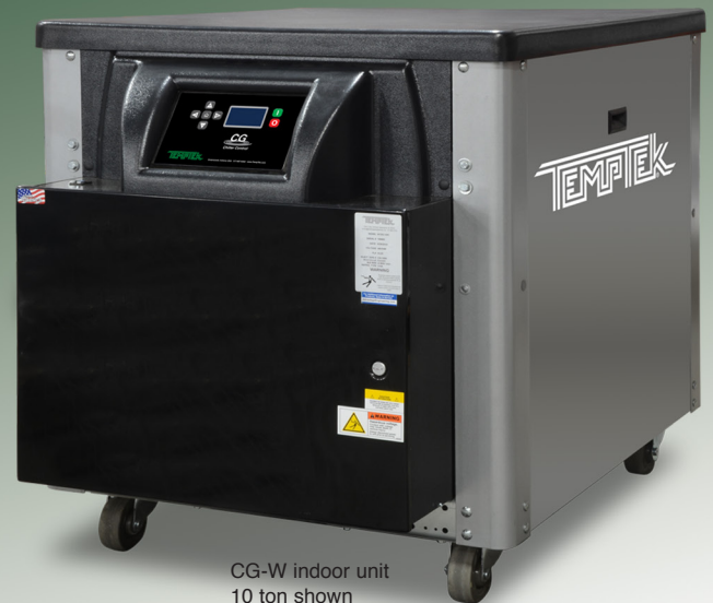
CG-W indoor unit 10 ton shown

The CG-W Series portable chiller provides precision temperature control from an economically affordable and reliable unit. Perfect for applications such as plastic injection molding, blow molding, extrusion and other industrial applications.