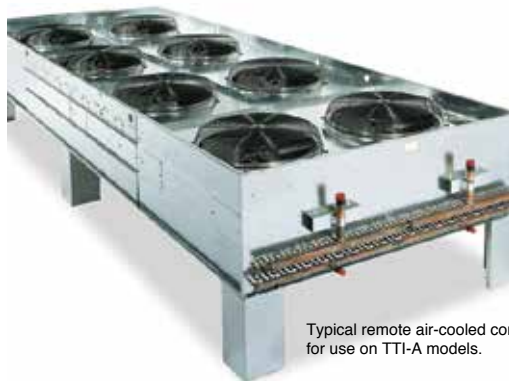
Typical remote air-cooled condenser for use on TTI-A models.