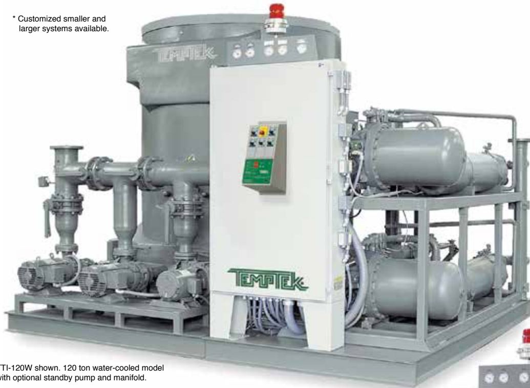
TTI-120W shown. 120 ton water-cooled model with optional standby pump and manifold.