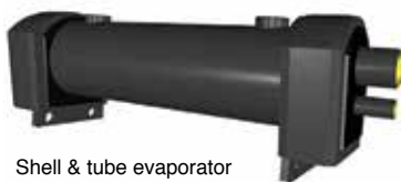
Shell & tube evaporator

Shell & tube evaporators are used on larger capacity systems. Refrigerant is circulated through copper tubes within the carbon steel shell to cool the process fluid that surrounds the tubes. Shell & tube evaporators are fully insulated and provide flexible, efficient heat transfer.