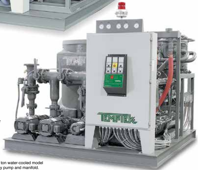
TTI-60W shown. 60 ton water-cooled model with optional standby pump and manifold.

PRICE & PERFORMANCE... for the LONG TERM