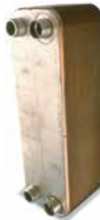
Brazed plate evaporator

Brazed plate evaporators are made of stainless steel plates brazed together with copper brazing material. This design promotes turbulent flow and high heat transfer rates in a compact, non-ferrous package. A cleanable basket strainer filter is included to protect the brazed plate evaporator from water born contamination.