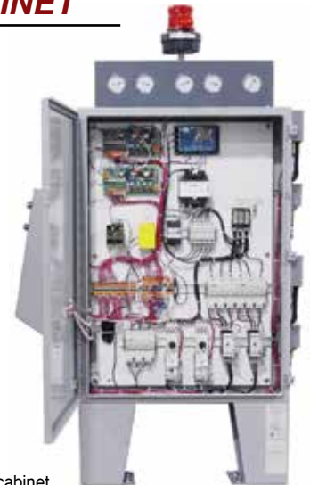
Typical electrical cabinet

* Water condensed only. Air condensed remote condensers require separate power.