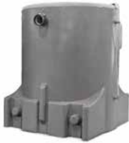
Polyethylene reservoir with insulation

The standard patented reservoir is a one-piece seamless design, rotationally molded from linear low density polyethylene and insulated with 3/8" dense foam insulation. The rectangular base accepts straight-line pump connections. The cylindrical shape adds structural strength. A tank baffle provides true 'hot-cold' operation. The standard service cover has cut-outs for distribution piping and an inspection opening. The tank volume is adequate to support expansion to 2 times its original chiller capacity (adding MA or MW chilling modules and additional pumps).