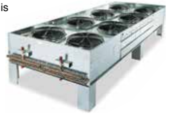
Remote Air-cooled condenser

TTI Series central chillers are offered with Air-Cooled or Water-Cooled condensers. The selection is influenced by the industrial environment where the TTI Series will be installed including available condensing water supply and plant ambient temperatures. The condenser is a heat exchanger where the heat absorbed by the refrigerant during the evaporating process is given off to the condensing medium. As heat is given off by the high temperature, high pressure refrigerant vapor, its temperature falls and the vapor condenses to a liquid.